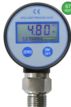
67mm Ø dial (bar example shown)