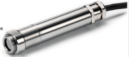
Thermocouple Type K, J, T or 4~20mA output 15:1 Field of View (Standard)

Supplied as standard with a 15:1 field of view. 30:1 also available.