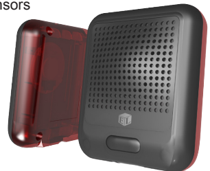
Audible and visual alarm