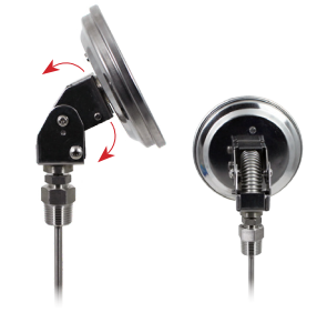
Fixed Position (Bottom Entry)