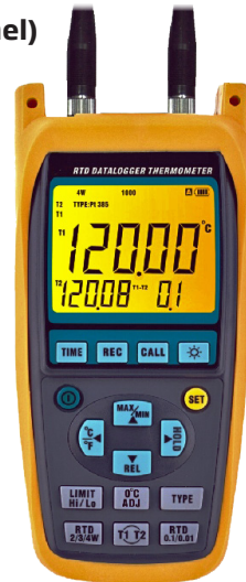
HDR-126U (2 channel) model shown